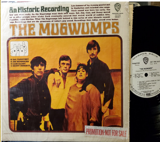
ITEM # K-313