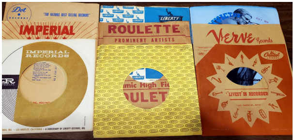
45 COMPANY SLEEVES 100/ $25 plus s/h