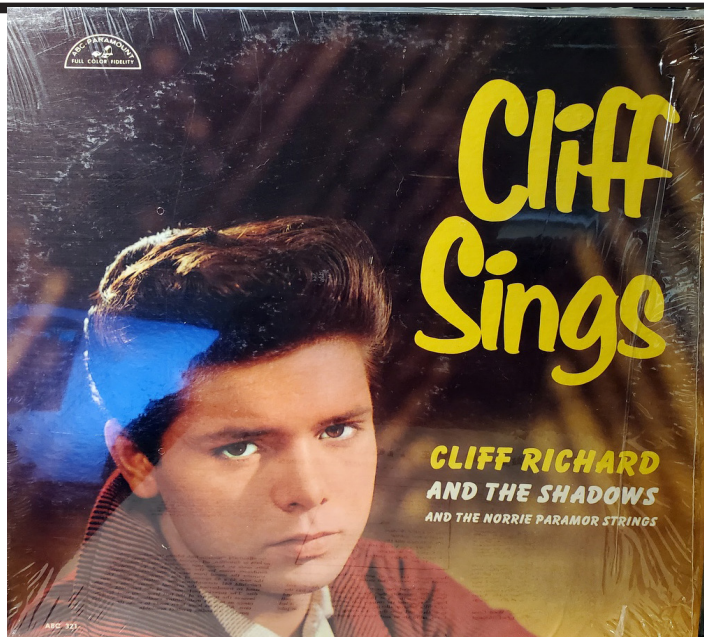
ITEM # K-307 -ROCK