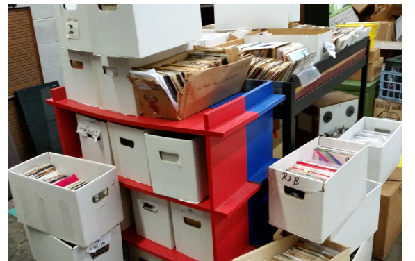
BULK 45'S BY THE BOX Approx 120/ $75 postpaid

Mostly all Classical Opera Types Pick up only Any reasonable offer takes them out most early 1900's