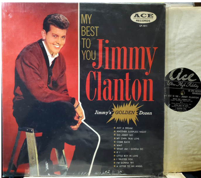
ITEM # K-312 ROCK