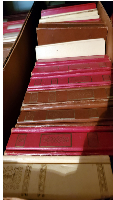
45 ALBUM STORAGE BOOKS