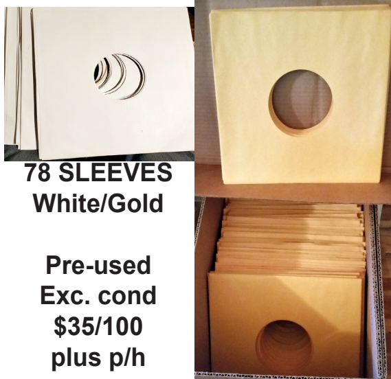
78 SLEEVES White/Gold