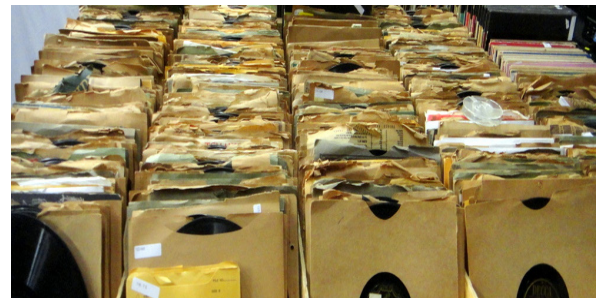
5,000-6,000 78's ALL SLEEVED EARLY 1900'S - 1950'S CALL WITH OFFER