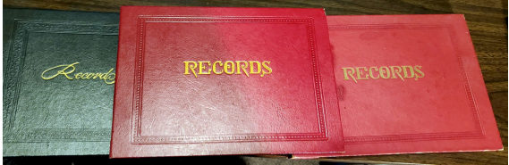
78 STORAGE BOOKS

Pre-used Exc. cond $35/100 plus p/h includes few 78s