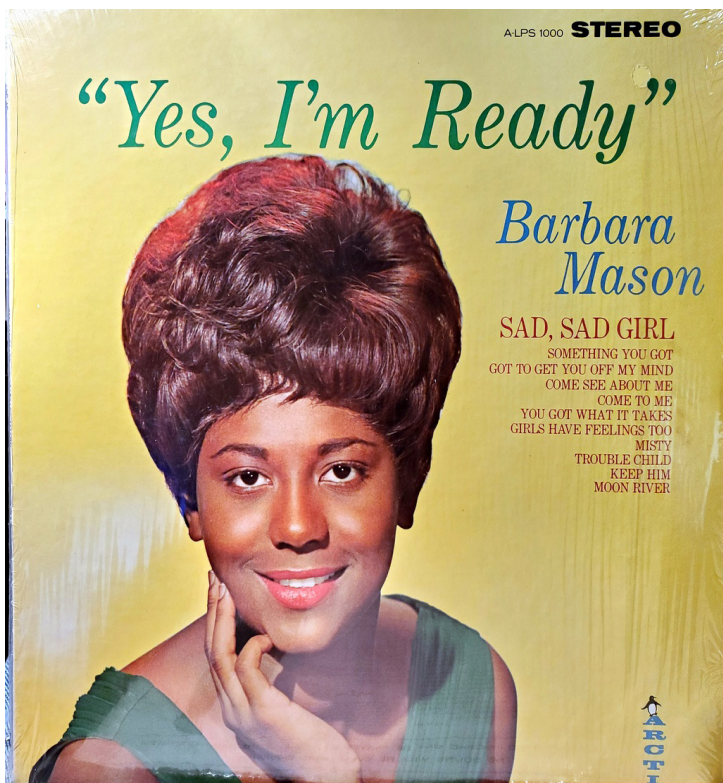
ITEM # K-308 ROCK