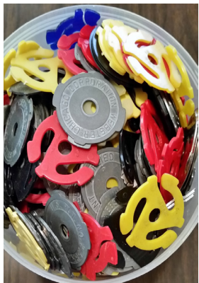
45 adapters 500+ available