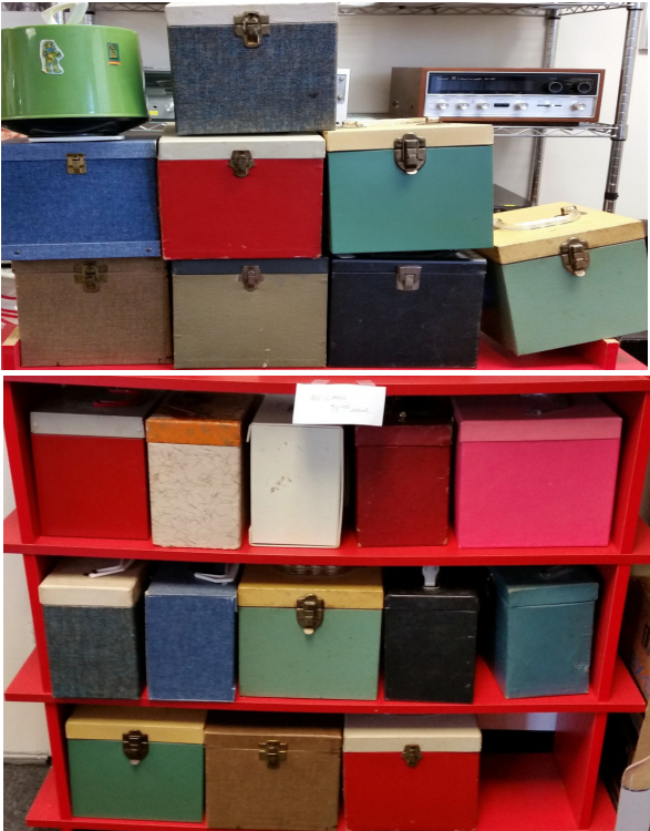
Call for availability and pricing (804) 261-1511 or email sales1@recordsmith.com RETRO STORAGE/CARRYING CASES FOR 45'S